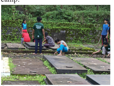
Students of BSW cleaning the cemetry

Ultimately the students, staff and also the people of the locality expressed that they were happy and contented about the rural camp.