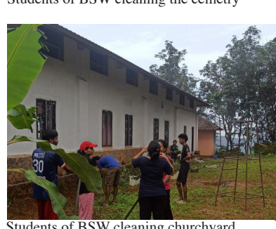
Students of BSW cleaning churchyard