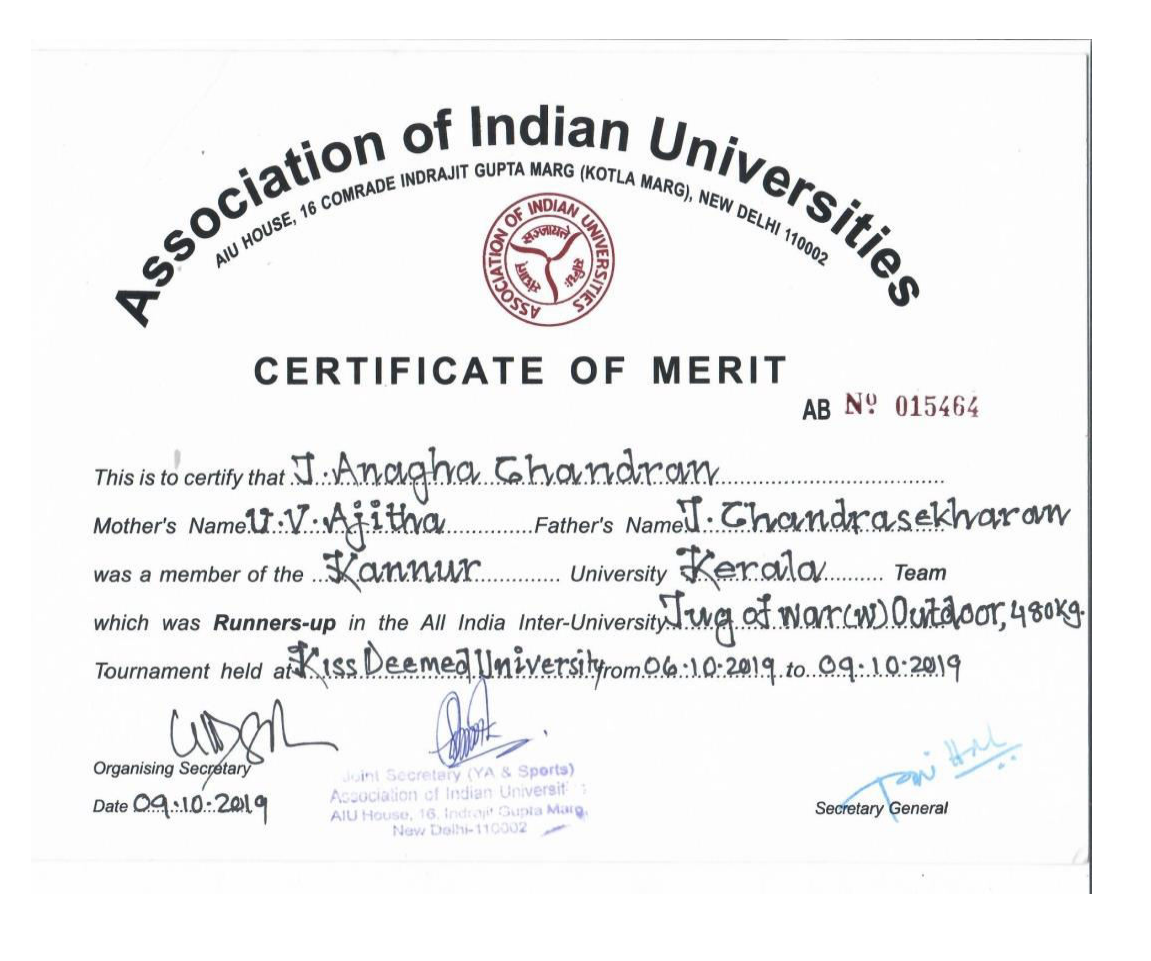
Tug Of War Kerala Team