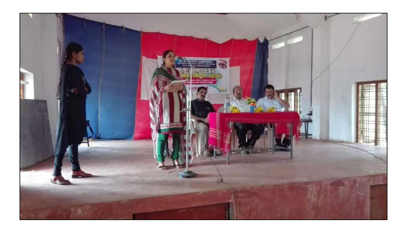
Figure 31 Eye-detection camp at the camp with Lion's Club Members & Eye Care Hospital officials