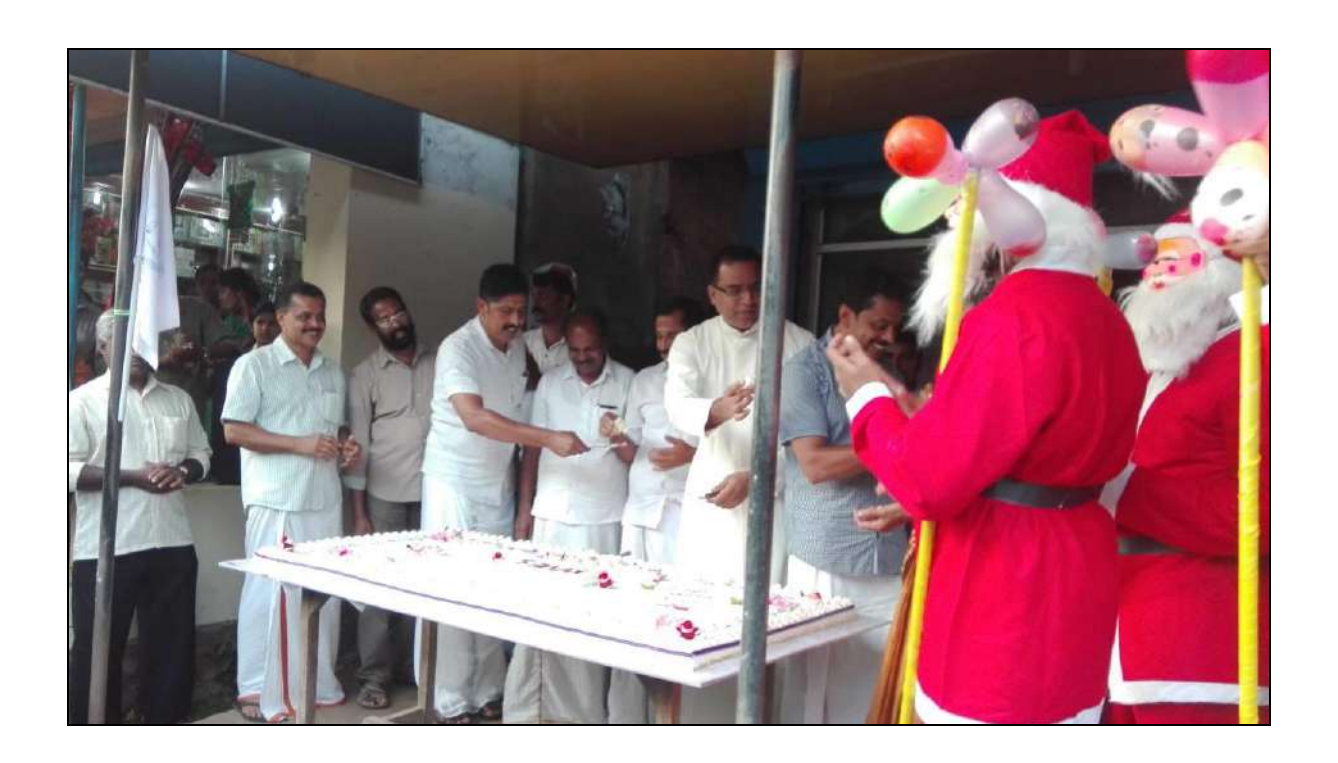
Figure 37 KVVES organising Christmas celebration with NSS volunteers