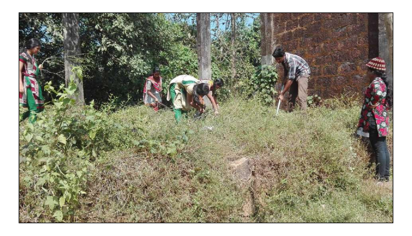
Figure 32 Volunteers at work site