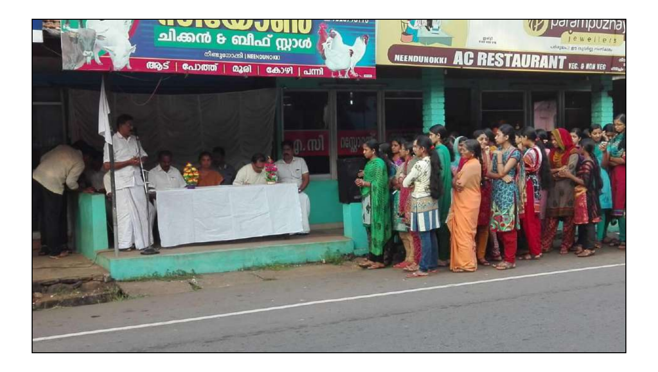
Figure 35 KVVES with NSS volunteers