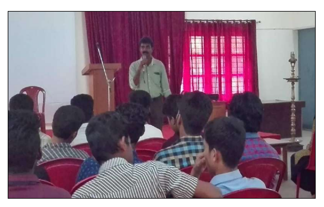
Figure 23 He is responding to students' queries