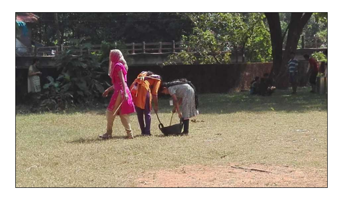
Figure 33 Volunteers at work site