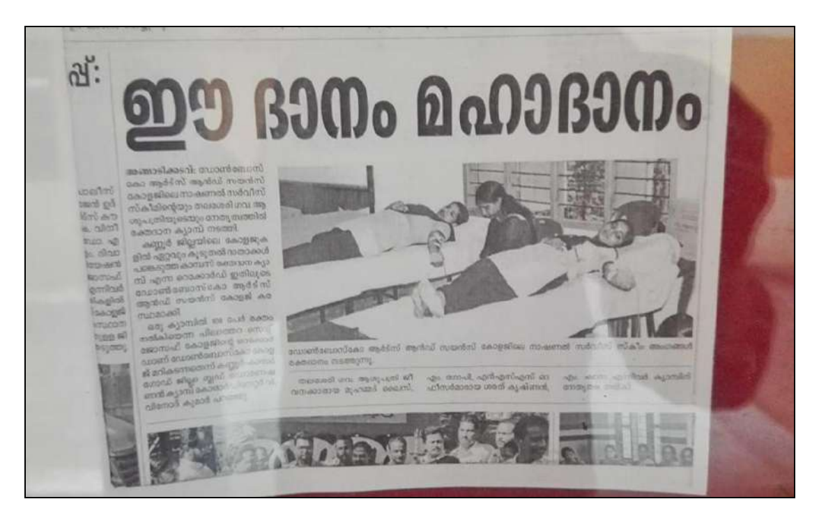
Figure 16 Report of Blood Donation in Newspaper