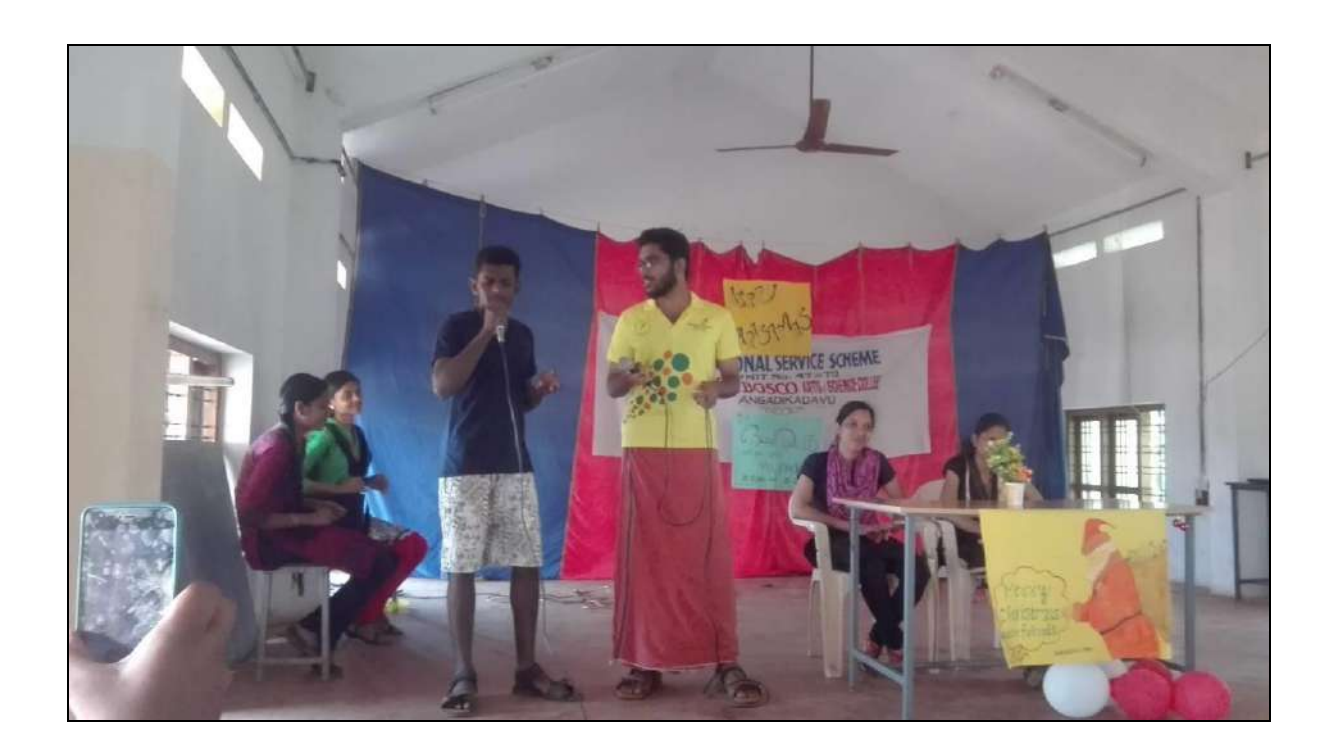
Figure 39 Volunteers celebrating Christmas