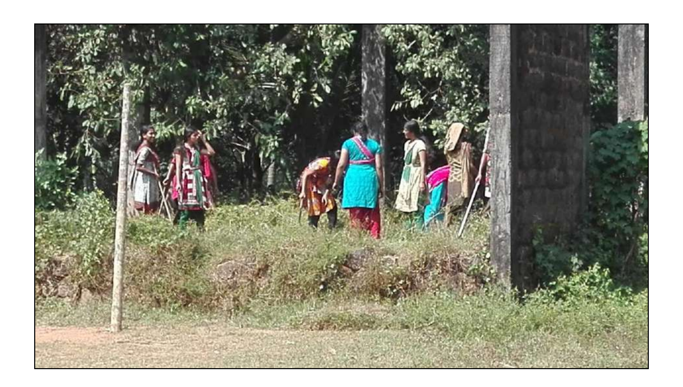
Figure 34 Volunteers at work site, at Neendunokki Mini Stadium