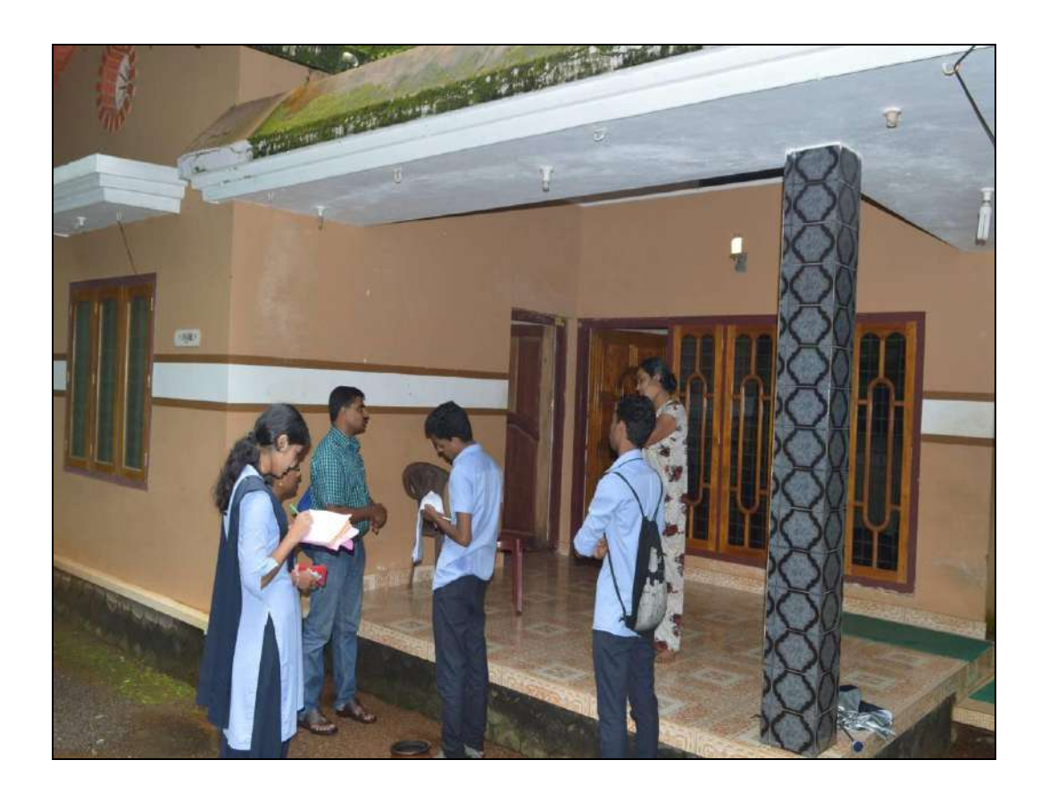
Figure 10 Volunteers with the Health Dept Officials Taking part in the Survey & Awareness