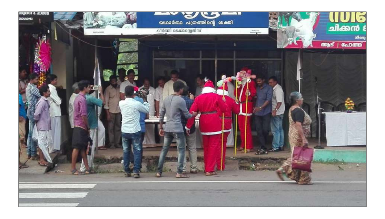
Figure 36 Volunteers in Christmas Papa's attire