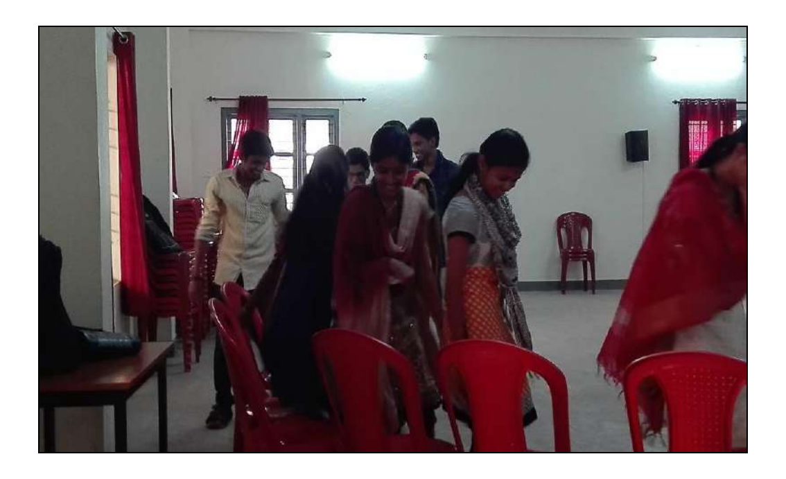
Figure 22 Various activities