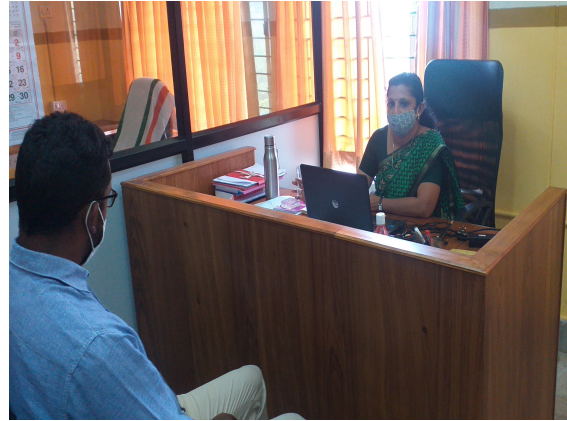
KIIFB (LA) Official