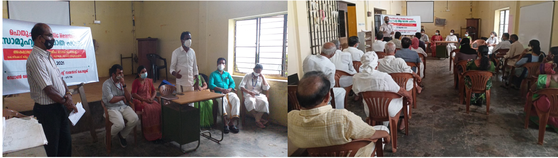
Public hearing session of the landholders in Thurayur Village side

The Second session of the public hearing of the landowners in Thurayur Village along with the authorities and other stakeholders was held at Welfare L.P School, Payyoli Angadi at 30.00 pm on 23/07/2021. (List of Public Hearing of the Participants - 2 is in the Annexure).