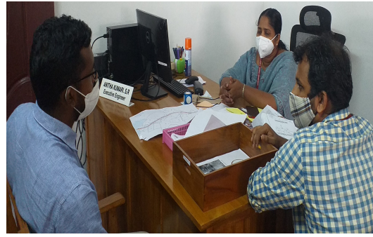
Executive Engineer &amp; AE