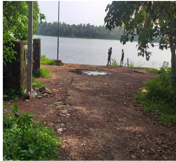
Kadavu –Muchukunnu side