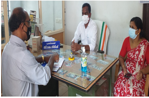
Discussion with Panchayath president