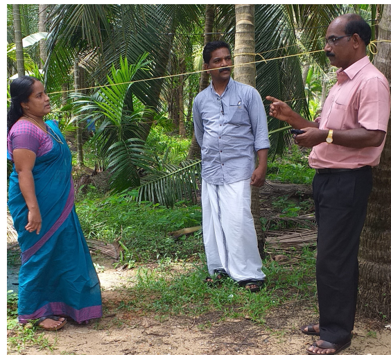
Standing Committee chairman & Ward member