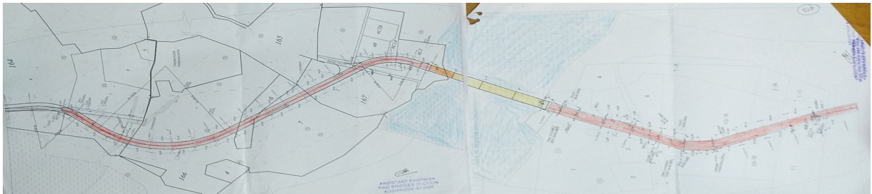
Alignment Sketch of the

The location for Akalapuzhakadavu bridge and approach road is at Muchukunnu in Moddadi village on one end and at Keerankai, Payyoli Angadi, in Thurayur village, on the other end.