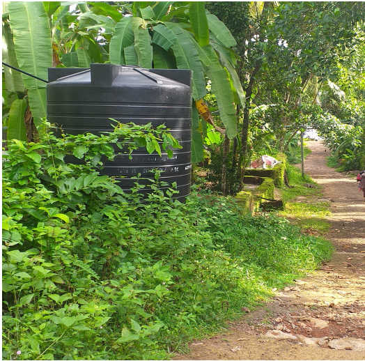
Water supply affected