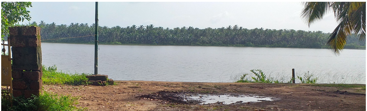
View from Muchukunnu, Moddadi side