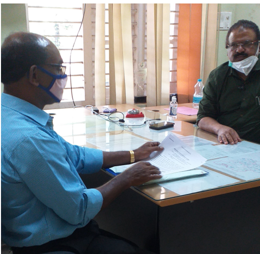
Deputy Collector (LA)