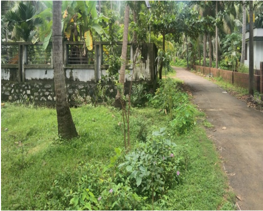
Wall and gate under dispute