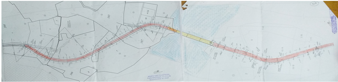
The Sketch of the Proposed Akalapuzha Bridge