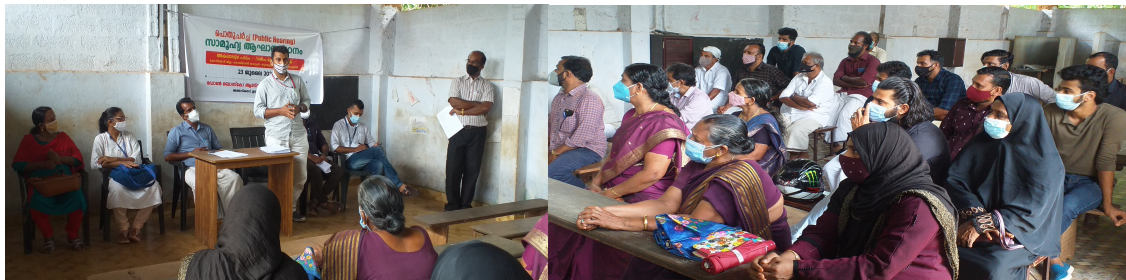
Public hearing session of the landholders in Muchukunnu side, Moddadi Village

In connection with the land acquisition for Akalapuzhakadavu Bridge cum Approach Road from Moddadi village in Koyilandy Taluk, a public hearing of the landowners along with the authorities and other stakeholders was held at Govt. U.P School, Muchukunnu North at 10.00am on 23/07/2021. In the afternoon the second session of the public hearing for the Thurayur side was held at Welfare L.P. School Payyoli Angadi at 03. Pm. Attendance sheet attached in the annexure (List of Public Hearing Participants-1).