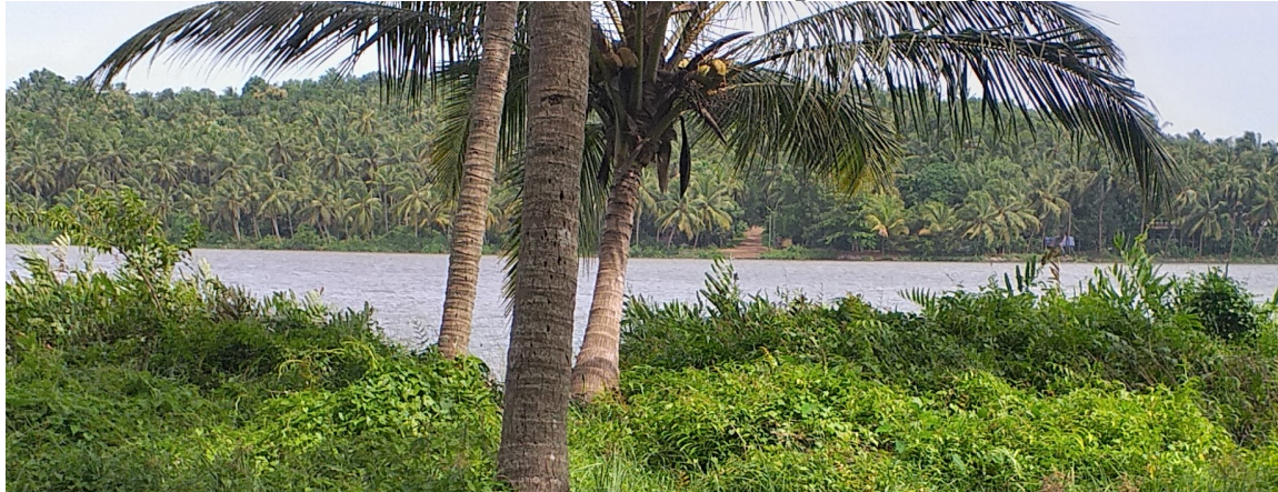
View from Thurayour side